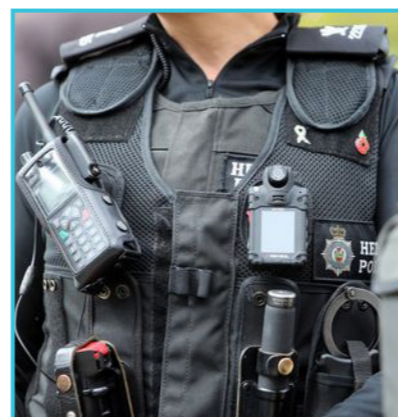
Swyddog Heddlu / Police Officer

As the Police and Crime Commissioner for North Wales one of my main responsibilities is to set the annual precept, which is the part of the policing budget that is raised from local taxes. The level of the precept determines the total budget available for policing in North Wales, and its importance to the quality, effectiveness and efficiency of policing in North Wales cannot be overstated in making North Wales the safest place in the United Kingdom.