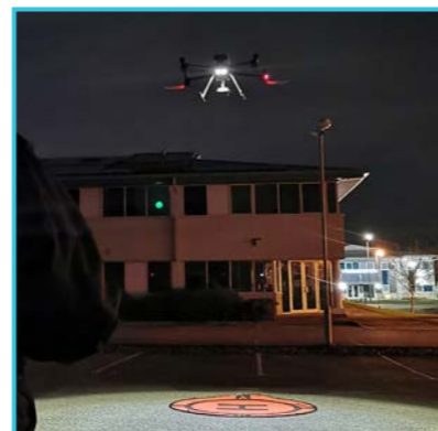
Uned Drôn / Drone Unit