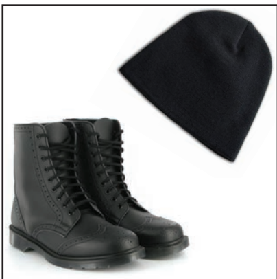
Or sometimes headgear and footwear