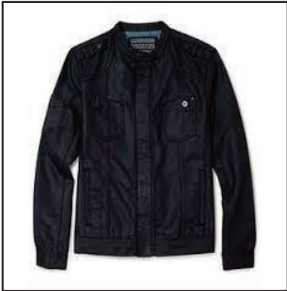
Coat or jacket