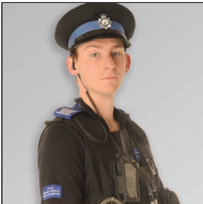
A PCSO in uniform