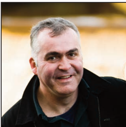
A police officer in normal clothes with police id