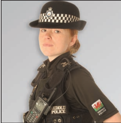
A police officer in uniform